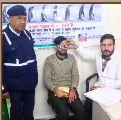
Eye & general health check up of drivers organized by Delhi Traffic Police.