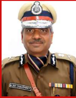
Sh Ajay Chaudhary, IPS Special Commissioner/ TMD( Zone II)