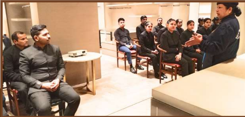
Road safety awareness programme for staff of The Chanakya mall, Chanakya Puri