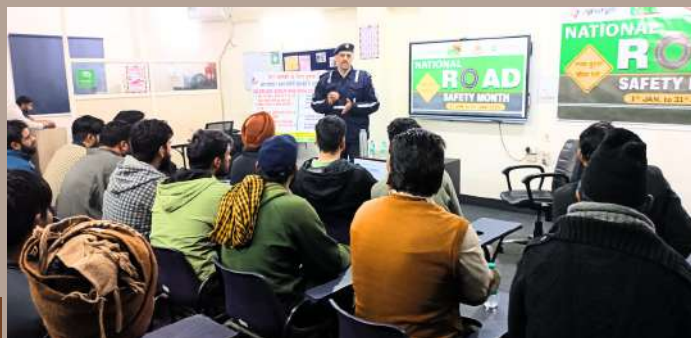
34 truck drivers sensitized at Sanjay Gandhi Transport Nagar