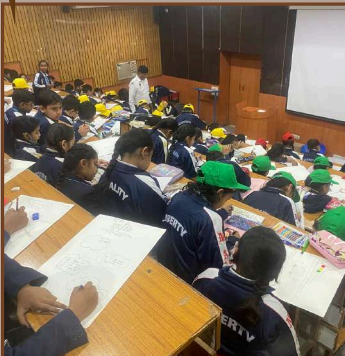
Over 150 students participated in a Painting competition on Traffic Rules at Maharaja Agrasen Public School