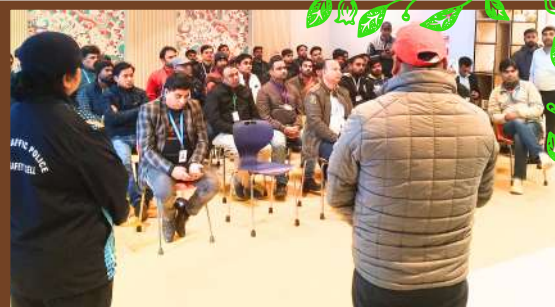
Over 60 staff members of Tata Communications Ltd, participated in the awareness programme by Delhi Traffic Police.