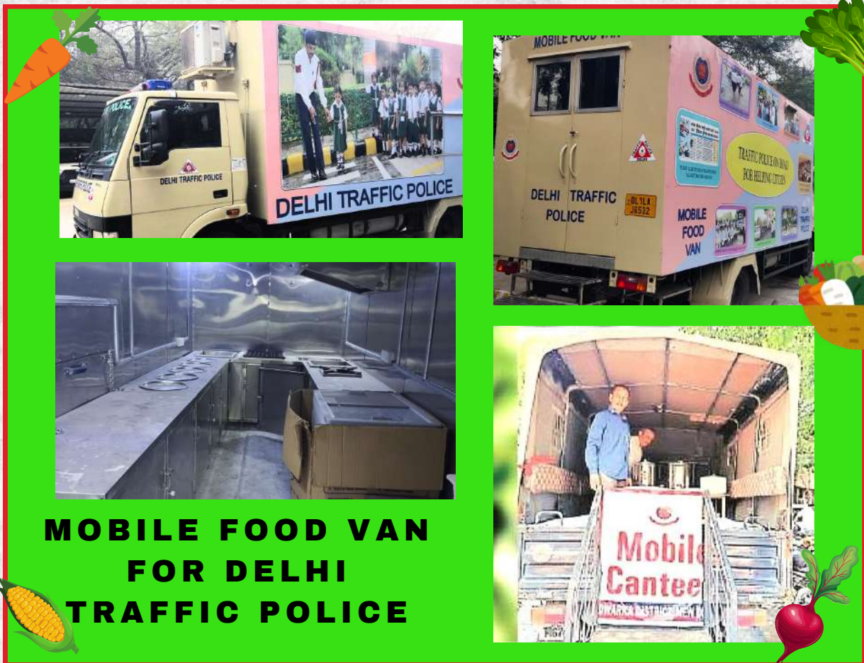
MOBILE FOOD VAN FOR DELHI TRAFFIC POLICE