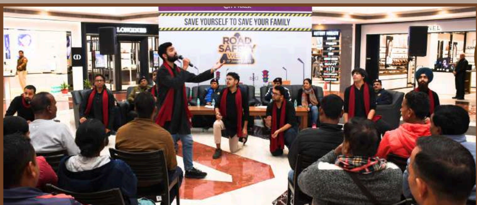
Road Safety awareness programme including lecture and drama skit at Select Citywalk mall enthralled many.