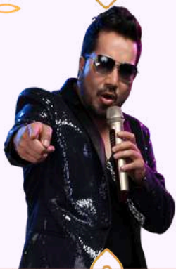
MIKA SINGH Singer

“Delhi Traffic Police personnel have been doing a commendable job in ensuring smooth movement of traffic on the roads of National Capital. Despite scorching sun and extreme weather conditions, they are performing without break. As citizens we have responsibility to strictly follow the rules and cause minimum hurdles on the busy roads of Delhi. Wear helmets, seat belt, stop before stop line in the red light signal, religiously follow lane driving rule and no matter what, we should never talk to mobile while driving. These are very basics for everyone to follow while driving on the road. Listen to my music while driving but at the same time follow traffic rules and concentrate in driving please.”